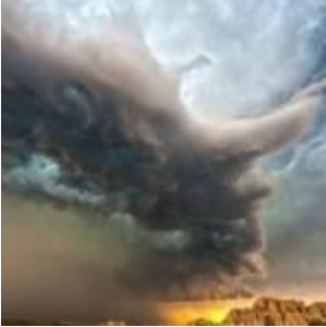
Dissipating Anger via Prayer