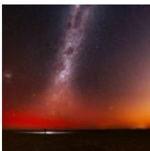
Recognizing Differences between Anger and Rage