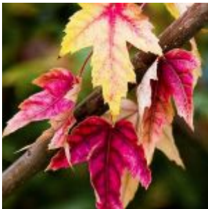
The Value of a Bus Ticket