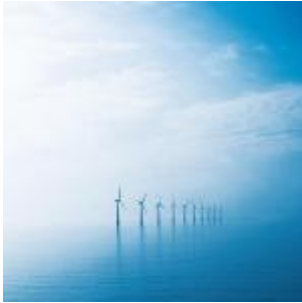
The Crooked Cure